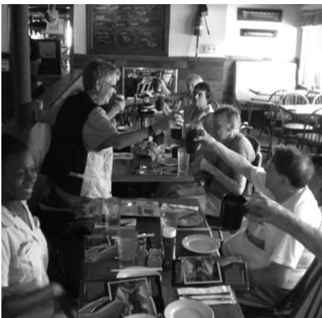
Cheers! Residents of Thompson House enjoy a scenic trip to Maine, complete with a visit to the shore, lunch at a seafood restaurant and ice cream for dessert.